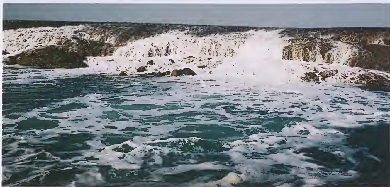
Figure 10. The reef edge at low tide; major channel, south west of Wulajarlu Island, Montgomery Reef.

terraces. The depth of the algal crust is unknown but is probably superficial.